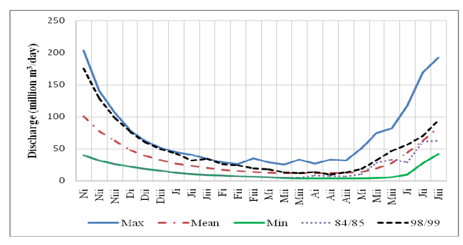
Figure 42: Flow hydrographs of the recession period at Eddeim station